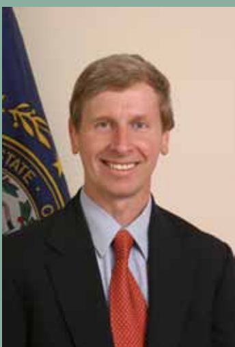
Governor John Lynch

Please join us for this Chamber breakfast forum